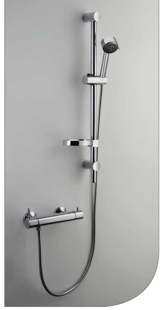
Vettora TMV2 Bar Shower Mixer